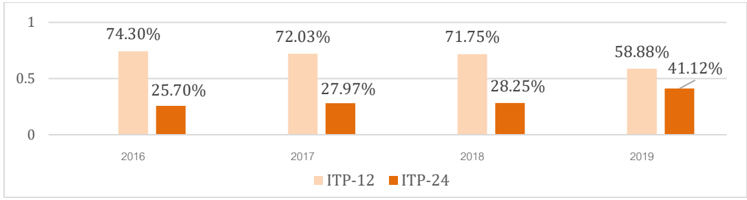
Figure 1. Distribution of 12-week Internship and 24-week Internship

Knowing the importance of workplace learning as well as key factors impacting workplace learning experience from the literature review, the aims of this study were to establish evidence that the introduction of structured internship does produce outcomes that are aligned to these review findings. In fact, with the introduction of EIF since 2015, two positive trends were already observed. First observation was that learner's performance in internship modules was generally better than most of the other academic modules. Second observation was that more learners were opting for 24-week internship instead of the hybrid model of Internship (12-week) and Final Year Project work(12-week). This second trend is shown in Figure 1 where the percentage of learners opting for ITP-24 has increased from 25.7% in 2016 to about 41% in 2019.